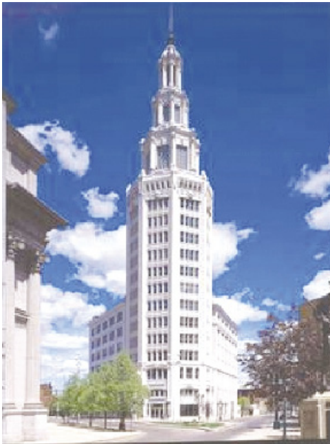
535 Washington Street - Buffalo, NY