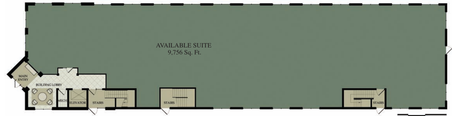
1st Floor - Suite 100