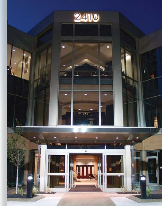
▲ MAIN ENTRANCE AT NIGHT