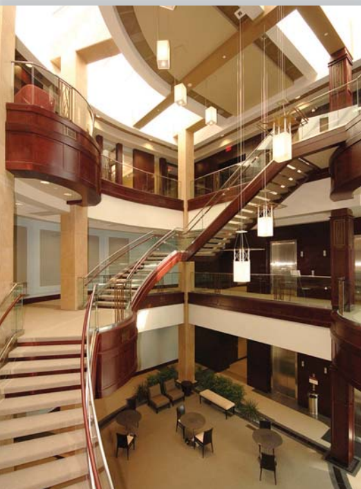
▼ GRAND ATRIUM - SECOND FLOOR VIEW

Up to 35,000 square feet still available.