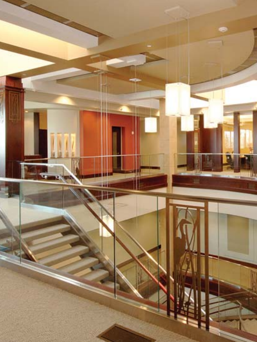
▲ GRAND ATRIUM - THIRD FLOOR VIEW